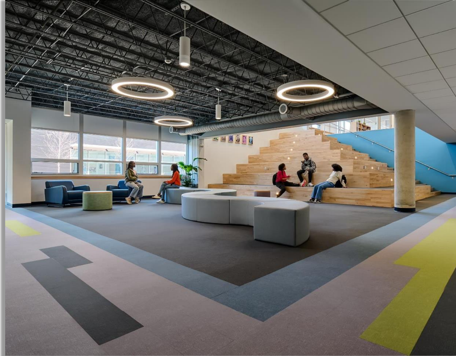
Winooski School District

Facility Committee includes: board members admin staff community members