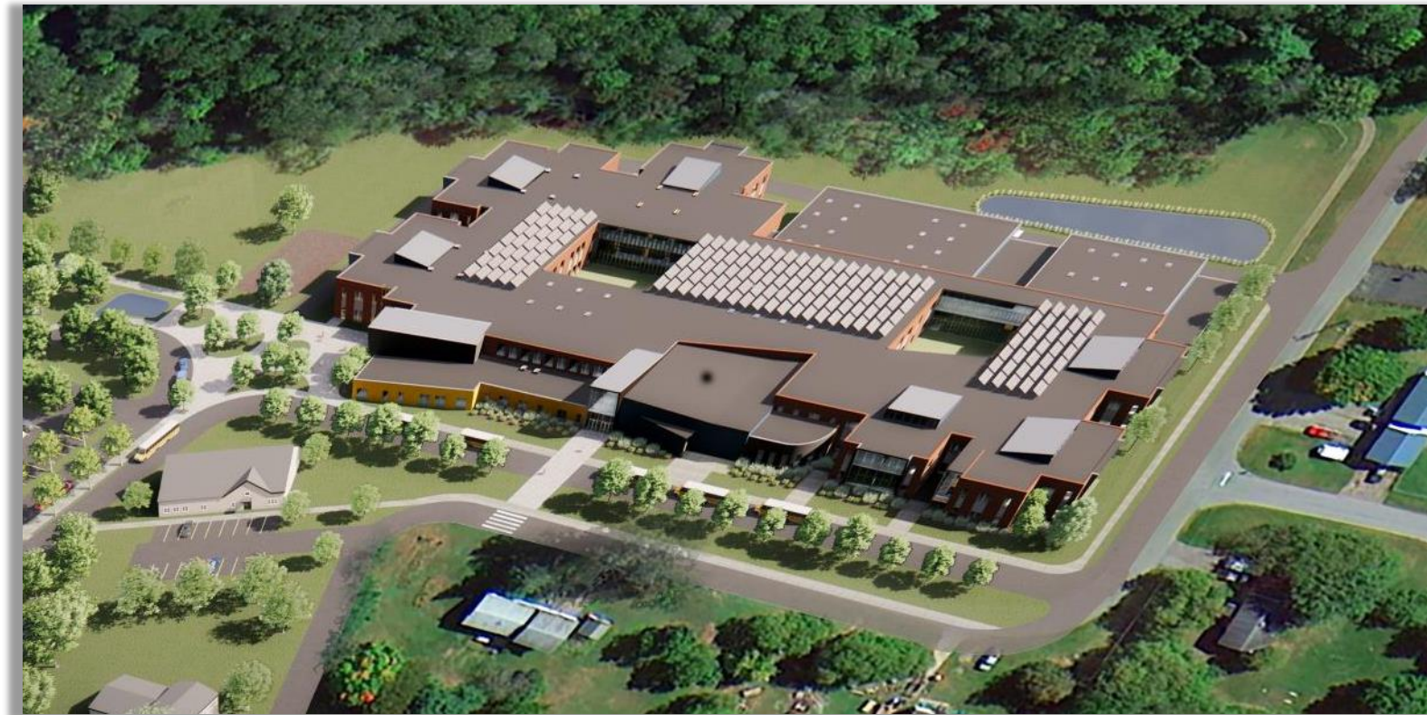
Milton Elementary Middle School