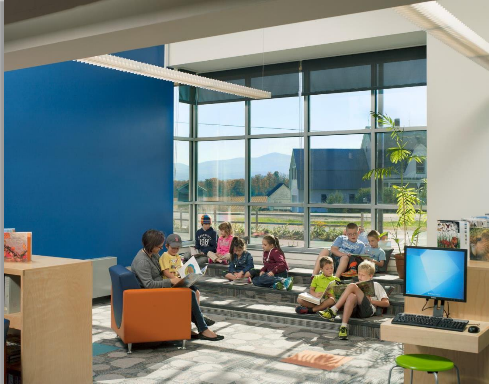
East Montpelier Elementary School