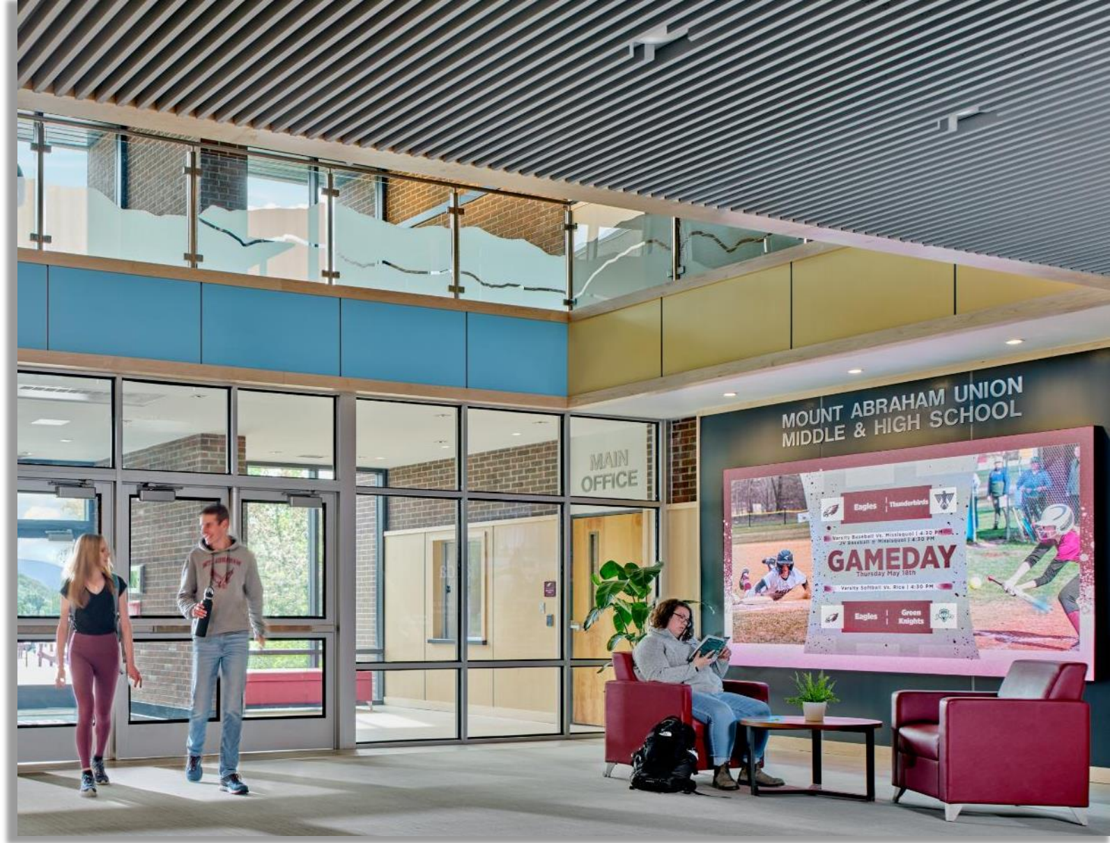
Mount Abraham Middle High School

Grant Funding subject to Legislative Approval