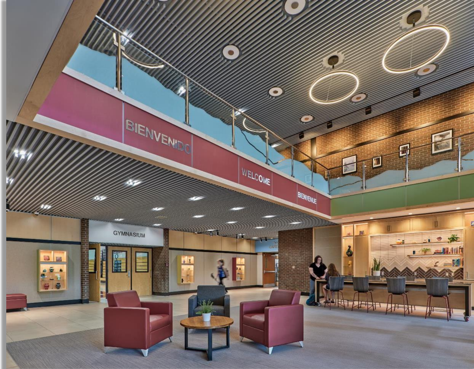
Mt Abraham Middle High School