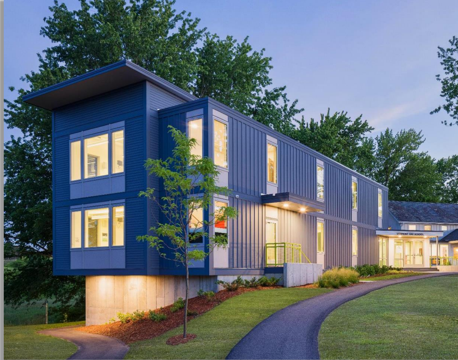
Vermont Day School

Consistency across district = equitable access