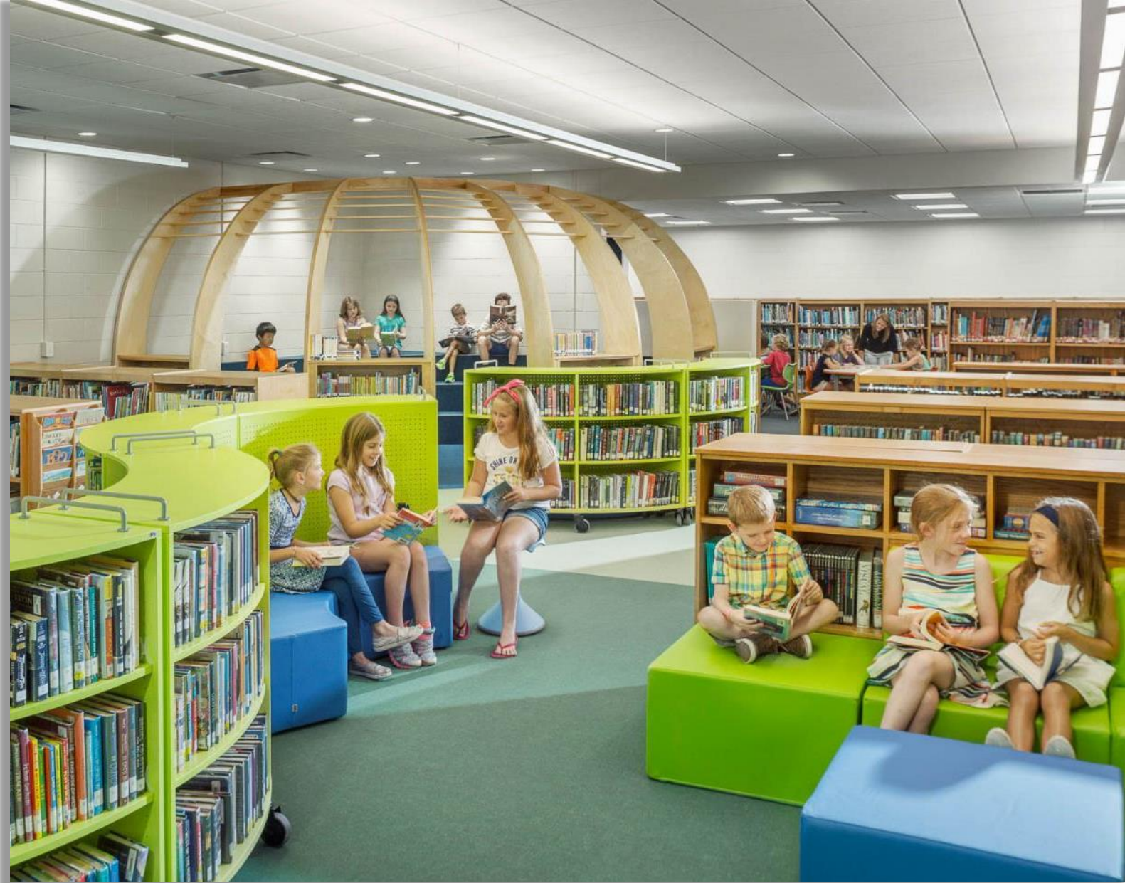
Williston Central School