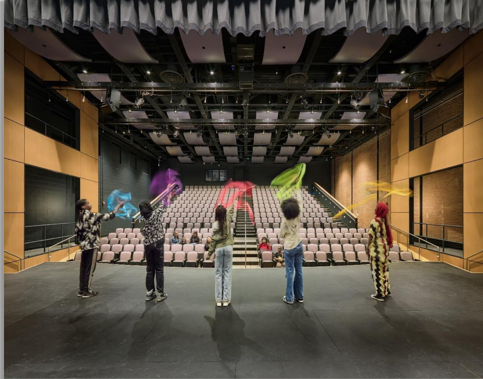
Winooski School District