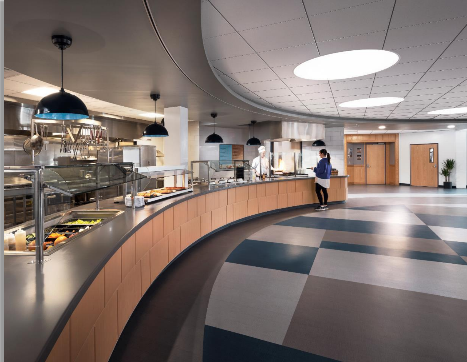
Middlebury Union High School